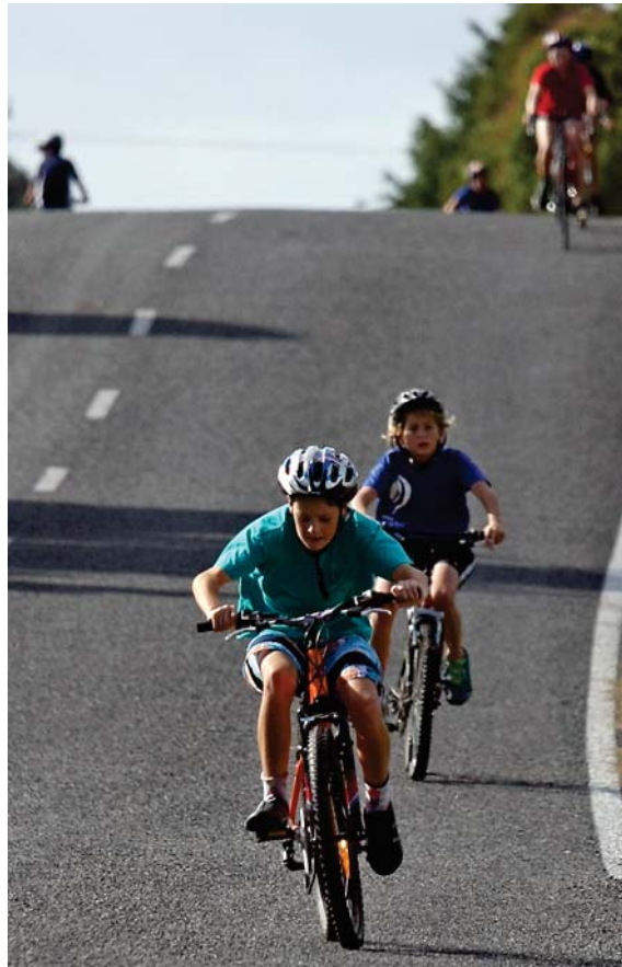
• Triathlon competitors battle it out on the cycling leg